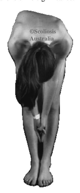
The Forward Bend Test

Apart from the outward signs with a teenager standing as illustrated, the reliable Forward Bend Test is used in the diagnosis of scoliosis. This simple visual examination requires the teenager to stand with the feet together and parallel and bending forward as far as she can go with the hands, palms facing each other, pointed between the two big toes. In scoliosis, one side of the upper chest (thoracic) region or the lower back (lumbar) region will be more than 1cm higher than the other. The prominence is most often on the right side in the thoracic region. If the difference between the two sides is less than 1cm, it is highly unlikely that a significant curvature is present and the difference is simply due to asymmetrical growth of the two sides of the body. This is called torso asymmetry and is of no significance.